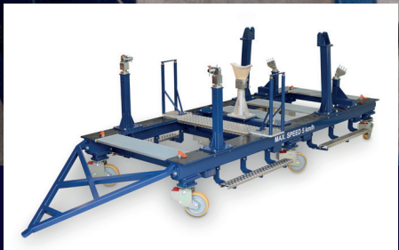
LM6000 Maintenance Dolly

Rely on VBR to keep your engines running