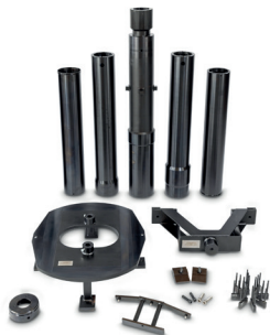
LM6000 Fixture, Install/Remove HP Turbine Module