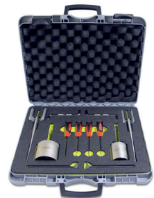
LM2500 Fixture set, Mating Seal Removal