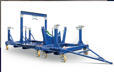
LM2500 Maintenance Dolly