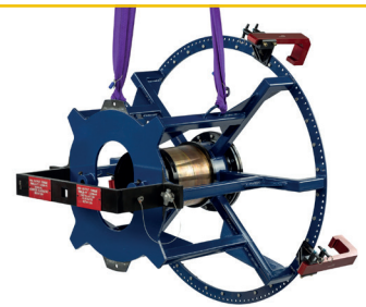
LM6000 Fixture, Install/Remove HPT Turbine Module Assy

Rely on VBR to keep your engines running