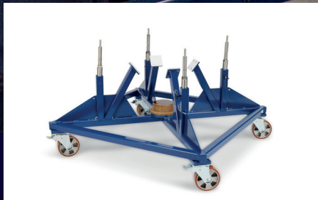
LM2500 HPT Vertical Stand