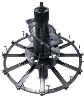
LM2500 Wrench - Horizontal/Vertical HPT Coupling Nut

Reach out to our tooling department for details or the complete listing at: tooling@vbr-turbinepartners.com or call: +31 88 010 9030.