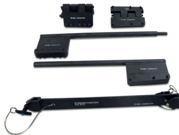
LM2500 Fixture, Hinge - Upper Compressor Case